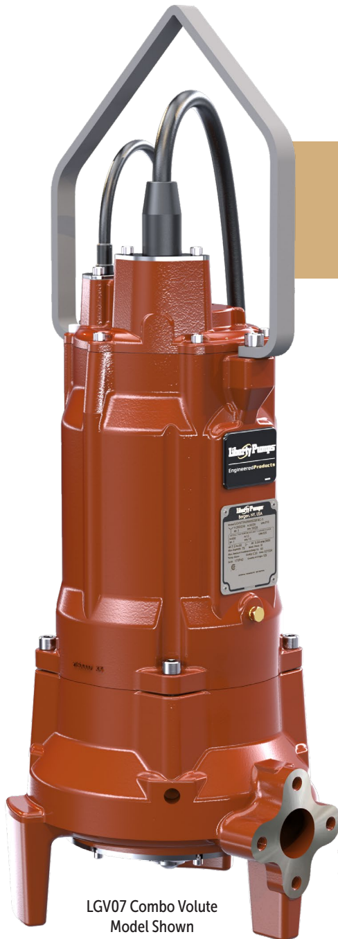
LGV07 Combo Volute Model Shown