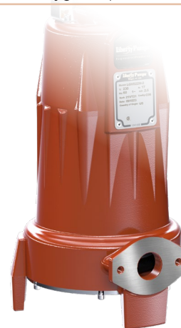
LGV02 2.5 hp Model Shown

Flygt is not affiliated with Liberty Pumps Engineered Products